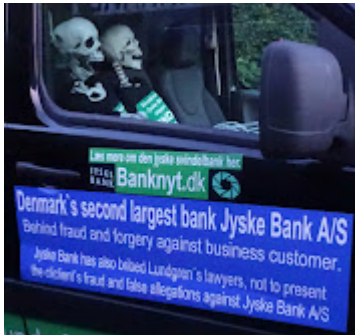
DSC05315 s.JPG 1031K