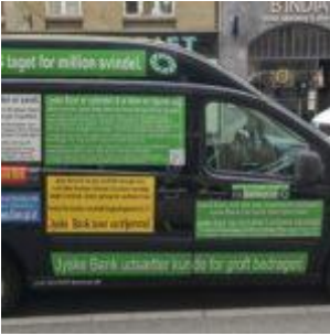
Jyske bank car advertisements .[/caption][caption id="attachment_22743"

Dam . foto Jyske Bank.[/caption][caption id="attachment_21997" align="alignleft" width="150"]