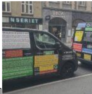
Jyske bank car advertisements .[/caption][caption

id="attachment_22801" align="alignleft" width="150"]