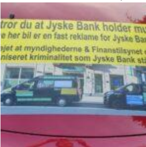
Jyske bank car advertisements .[/caption][caption id="attachment_22679"

advertisements .[/caption][caption id="attachment_22639" align="alignleft" width="150"]