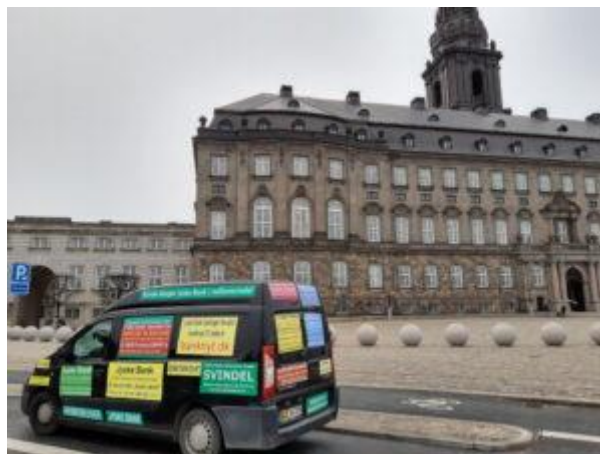
Christiansborg Slotsplads Denmark Copenhagen