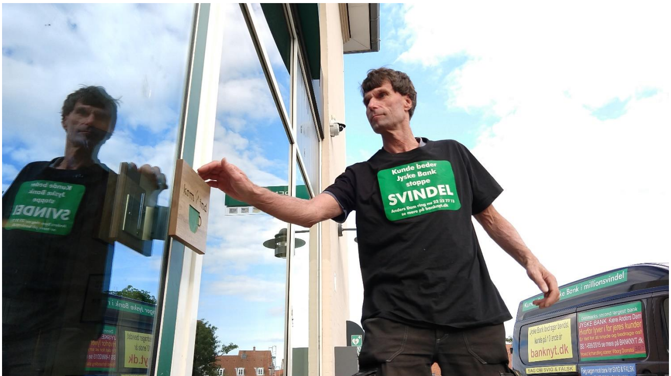
The Danske Bank Jyske Bank in Helsingør Denmark where the fraud against the bank's customer began back in 2008/2009 and with the help of Jyske Bank's branch at Vesterbrogade in Copenhagen

Was it deliberate or a mistake when Dan the Danish State at the government chose to do subversive activities to cover up Jyske Bank's crimes against the small customer, which here tells about the problem of cronyism and corruption deep into the Danish authorities.