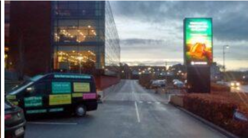
The Jyske Bank car on a visit to Silkeborg