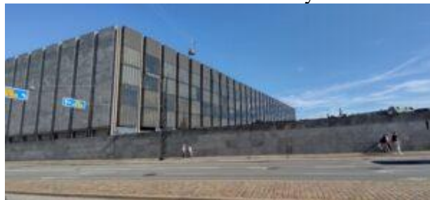
Case of organized fraud carried out by Jyske Bank A/S