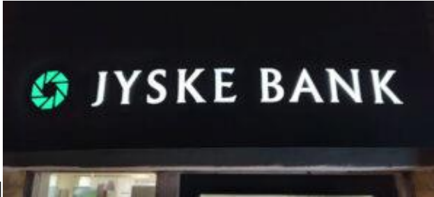
Find Jyske Bank Boxen her