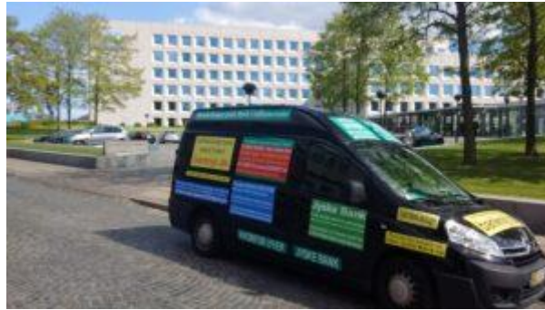
Several Maersk people raised their eyes when the Danish bank bil Jyske bank rolled onto the esplanade