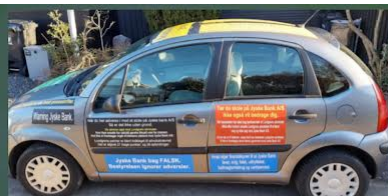
Når Jyske Bank koncernen står bag million svindel, hvilket er bevidst så virker det som bankens fundament.