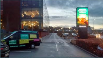
30 januar 2019. Jyske Bank bilen på besøg i Silkeborg, her fra klagen 05-06-2020 kan du finde en stor materiale samling, om de korrupte Lundgrens advokater og den kriminelle Jyske Bank.