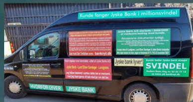
Jyske Bank har aktivt forsøgt at skade kundens retsstilling, ved at købe kundens advokater.