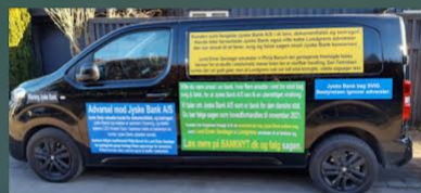
En flot og billig reklame for Jyske Banks forbrydelser.